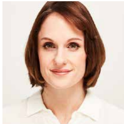
Actual BELOTERO® Lips patient, age 37