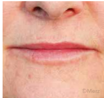
5 weeks after treatment