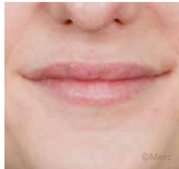
5 weeks after treatment

These patients were treated by Dr Kate Goldie. Individual results may vary.