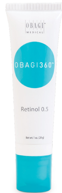
Obagi Retinol 0.5 ‡