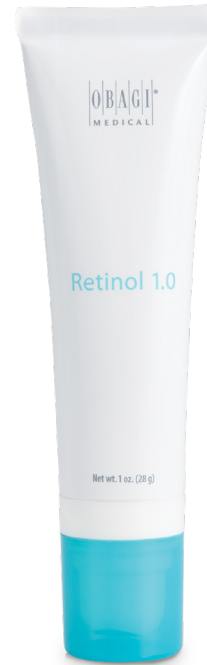
Obagi Retinol 1.0